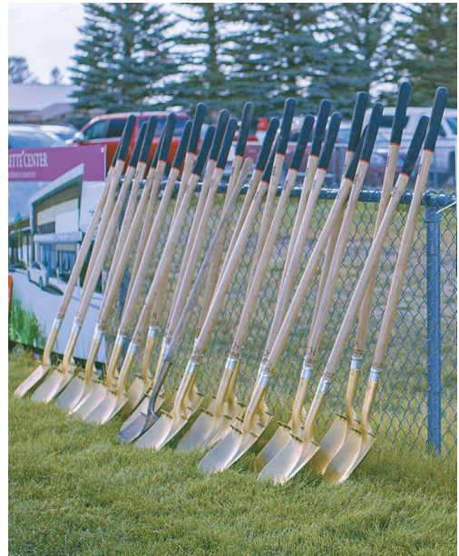
Golden shovels line the fence at the Sublette County Hospital and Long Term Care Facility groundbreaking on Aug. 25.