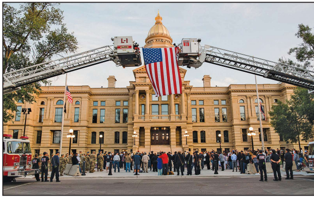
Fire and EMS crews from across Wyoming hung an American Flag in front of the Wyoming State Capitol during the ceremony on Sept. 11 to commemorate the 20th anniversary of the terrorist attacks in New York, Washington, D.C., and Pennsylvania.